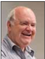
Dr. John Lennox

Dr. Lennox is Professor in Mathematics at the University of